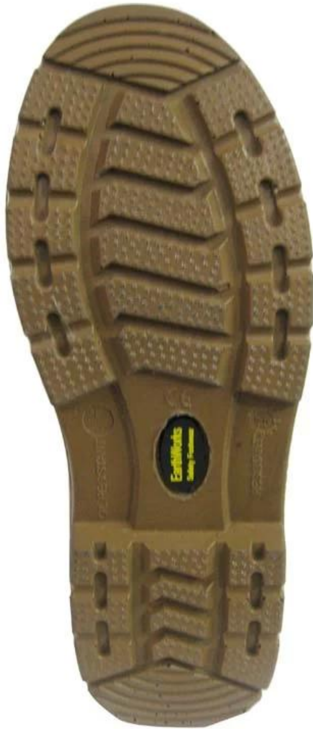
Safety Shoes sole model show: