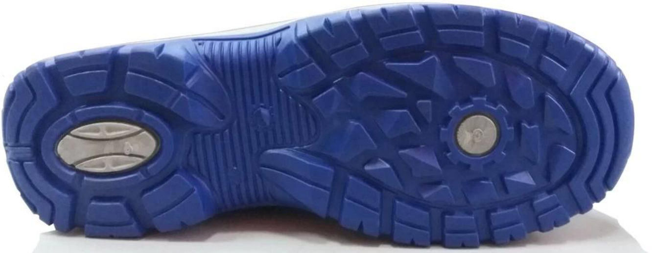
Safety shoes sole model show: