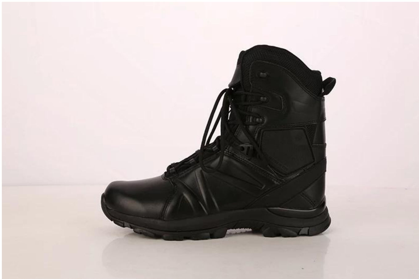
Detailed pictures of military boots army shoes: