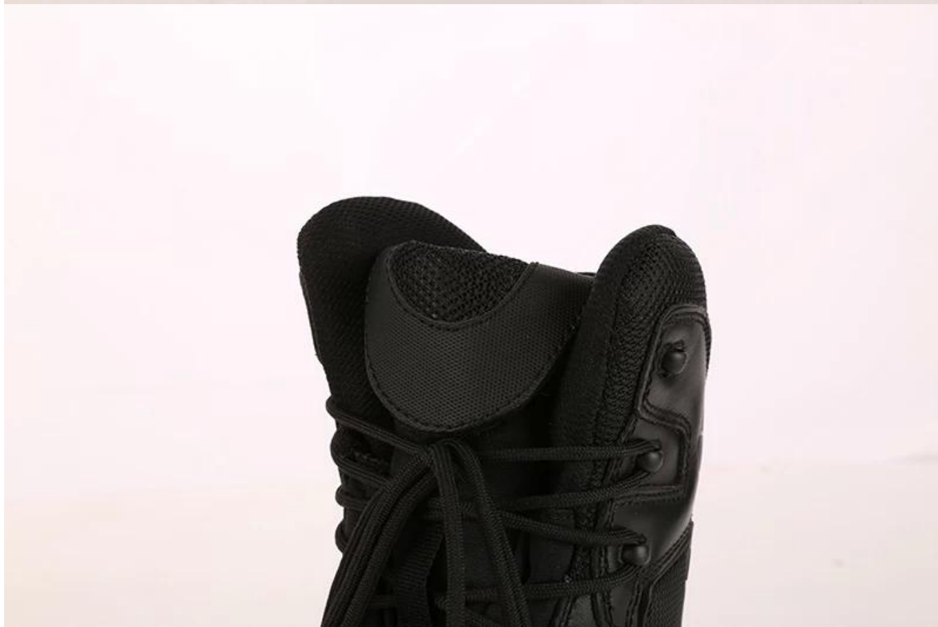
99011 military army boots sole show: