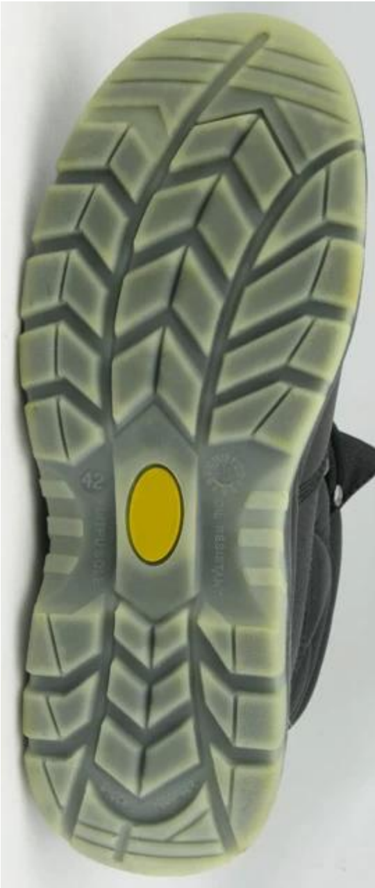
Safety shoes sole model show: