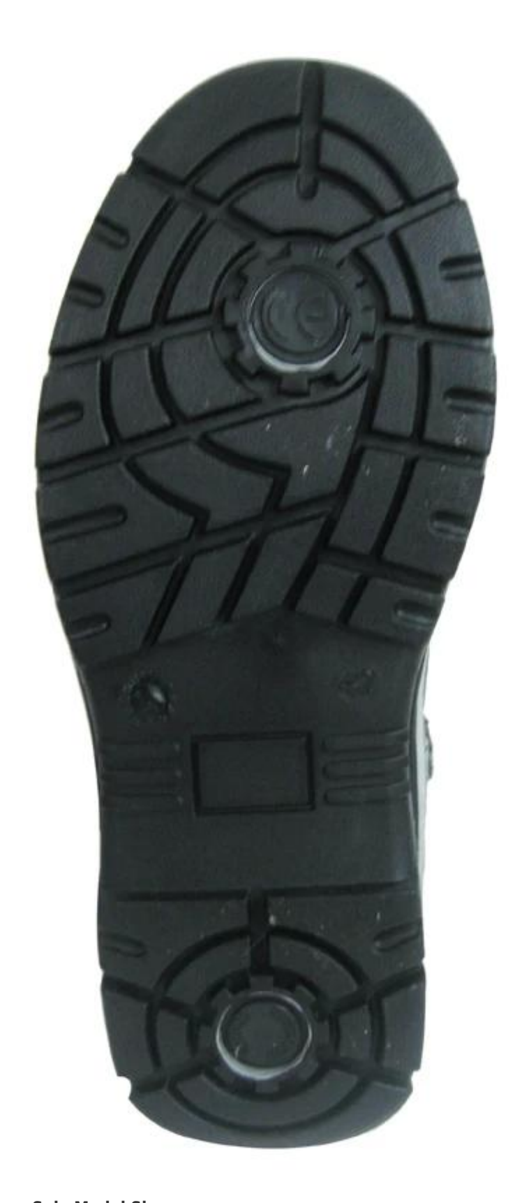
Safety Shoes Sole Model Show: