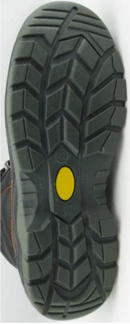
:أحذية السلامة عرض نموذج وحيد