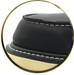
Waterproof cow genuine leather upper

Removable metatomical HI-POLY footbed provides long-lasting underfoot support and comfort.