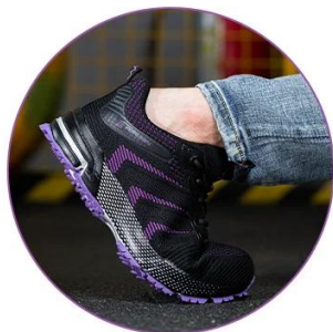
Breathable Mesh Upper

Breathable & Comfortable Uppers Compared with the traditional steel toed leather shoes , the fly weavingshoes are more breath and comfortable , and it will better fit your feet.