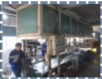
Heat - Setting