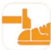
200 JOULE TOECAP