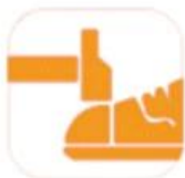
200 JOULE TOECAP