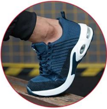
Breathable Mesh Upper