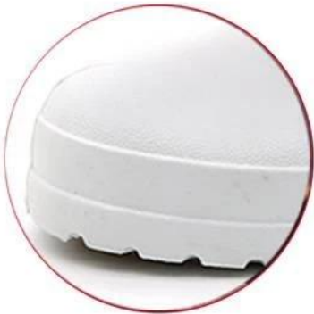
Waterproof EVA upper