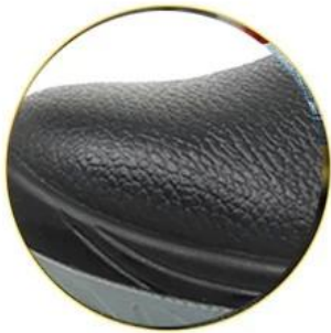
Waterproof leather upper

Removable metatomical EVA footbed provides long-lasting underfoot support and comfort.