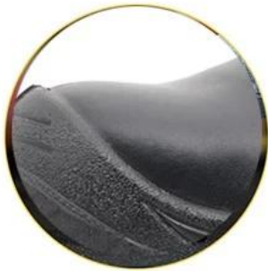
Waterproof leather upper

Removable metatomical EVA footbed provides long-lasting underfoot support and comfort.