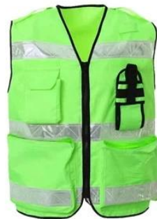
Reflective Safety Vest