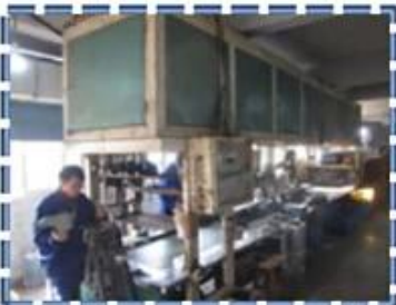
Heat - Setting