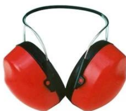
Ear muff/ Plugs