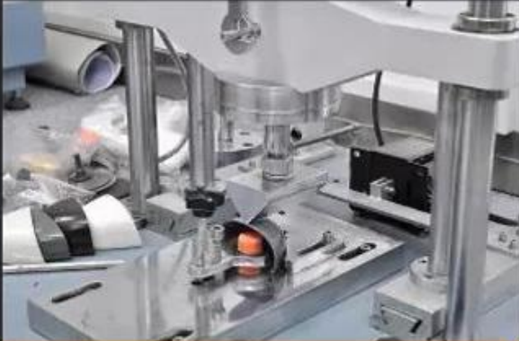
Toecap Test \geq 200 Joules