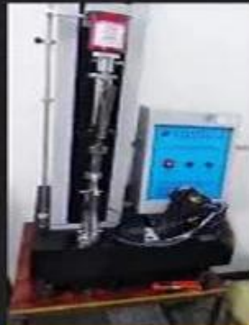
Bondness Test \geq 4.0 N/mm