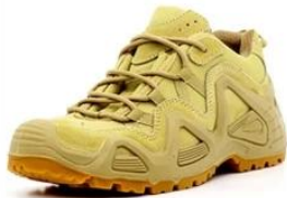
Safety Work Shoes

Link to PPE products website https://china-workwear.com