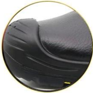
Waterproof cow leather upper

Removable metatomical HI-POLY footbed provides long-lasting underfoot support and comfort.