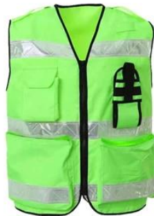
Reflective Safety Vest