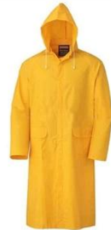
Rain Coat/ Suit