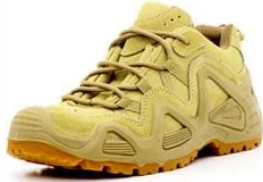
Safety Work Shoes