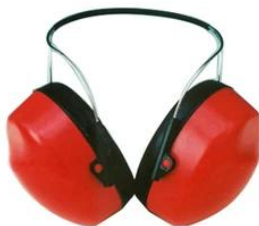
Ear muff/ Plugs