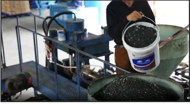
1. Mixing Materials