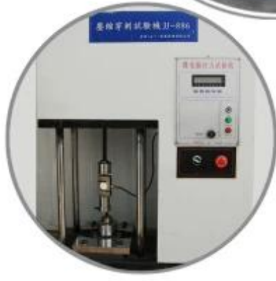
Puncture Testing Machine