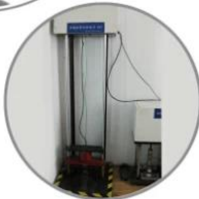
Impact Resistant Testing Machine