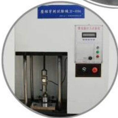
Puncture Testing Machine