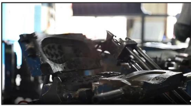
4. Open The Mould