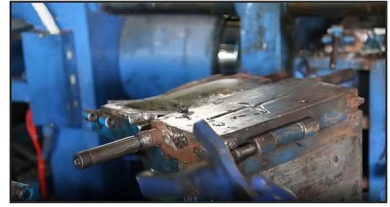
3. PVC Injection