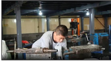
2. Putting Polyester Lining