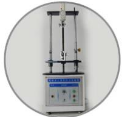
Tensile testing machine