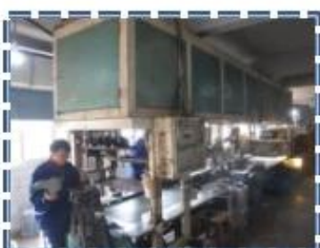
Heat - Setting