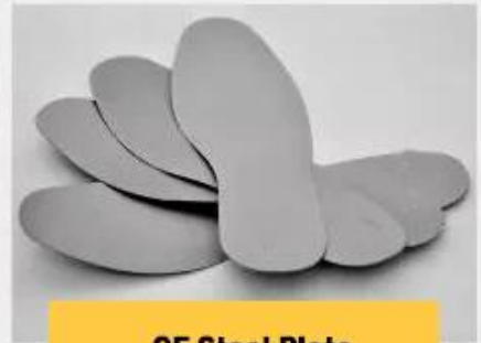
CE Steel Plate