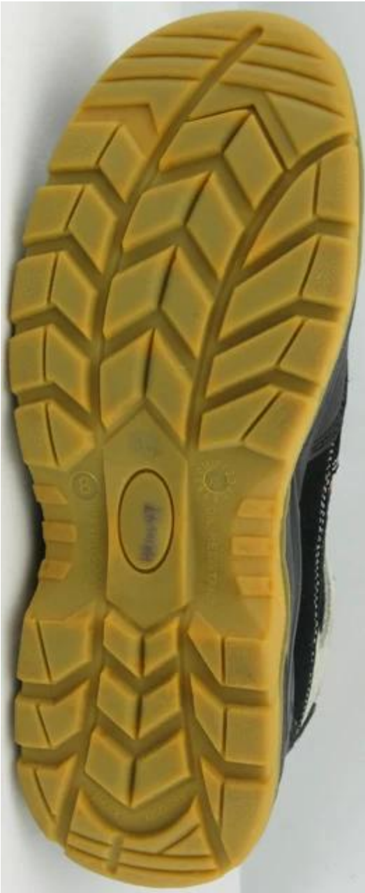
Chaussures de sécurité modèle unique show: