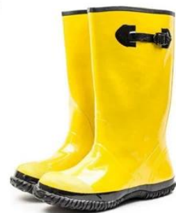
Yellow Slush Boots