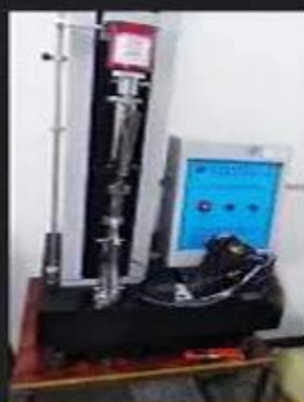
Bondness Test \geq 4.0N/mm