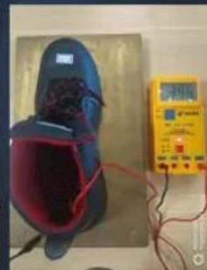
ESD Anti-Static Test