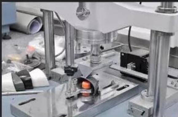
Toecap Test \geq 200 Joules