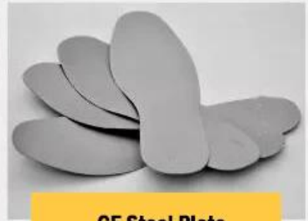
CE Steel Plate