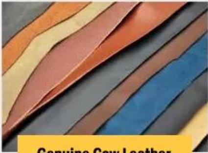
Genuine Cow Leather