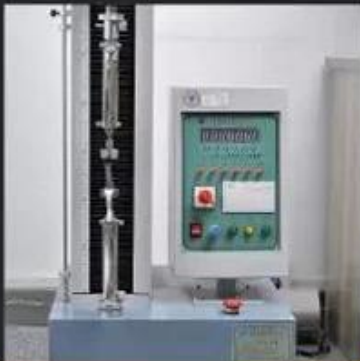
Tear Strength \geq 120\text{N}