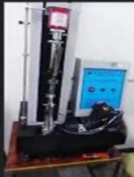
Bondness Test \geq 4.0\text{N/mm}