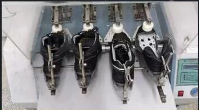
Flex Tester \geq 36,000\text{T}