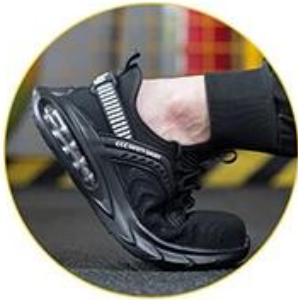
Breathable Mesh Upper

Breathable & Comfortable Uppers Compared with the traditional steel toed leather shoes , the fly weavingshoes are more breath and comfortable , and it will better fit your feet.