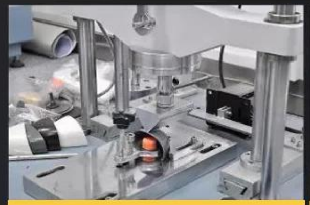
Toecap Test≥200 Joules