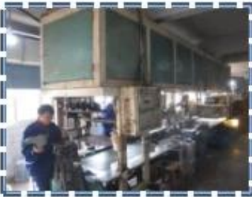
Heat - Setting