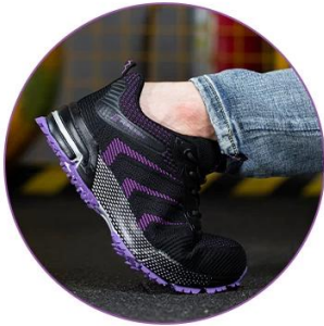
Breathable Mesh Upper

Breathable & Comfortable Uppers Compared with the traditional steel toed leather shoes , the fly weavingshoes are more breath and comfortable , and it will better fit your feet.