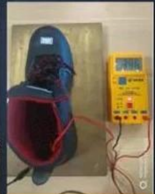
ESD Anti-Static Test