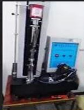
Bondness Test \geq 4.0 N/mm