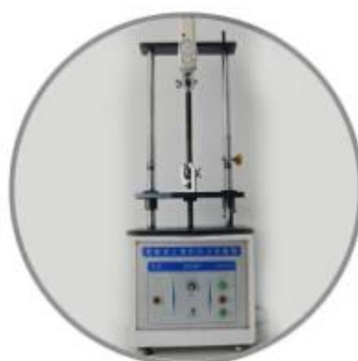
Tensile testing machine