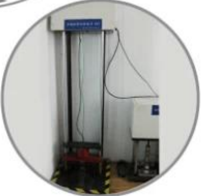
Impact Resistant Testing Machine