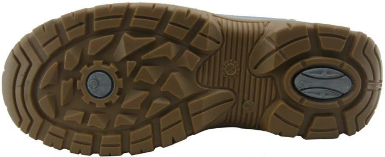
Safety shoes sole model show: