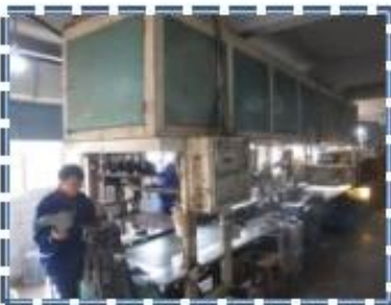
Heat - Setting