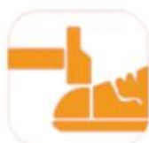
200 JOULE TOECAP