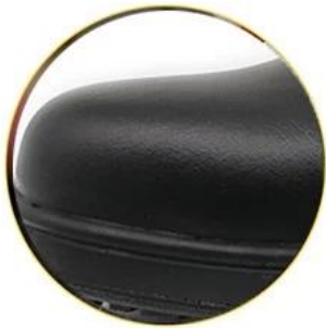
Waterproof leather upper

Removable metatological HI-POLY footbed provides long-lasting underfoot support and comfort.