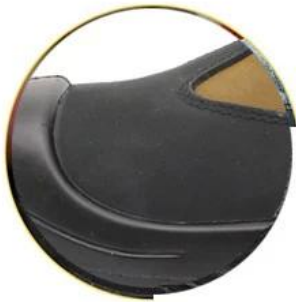
Waterproof leather upper

Removable metatological HI-POLY footbed provides long-lasting underfoot support and comfort.