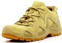
Safety Work Shoes

Link to PPE products website https://china-workwear.com