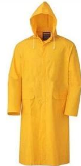
Rain Coat/ Suit