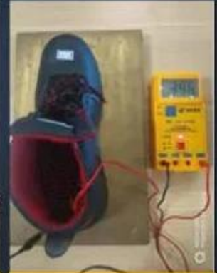
ESD Anti-Static Test