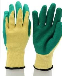
Safety Work Gloves