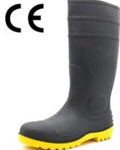
PVC Rain Boots