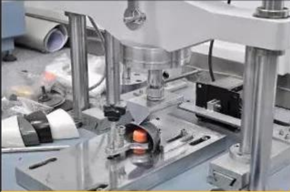
Toecap Test \geq 200 Joules