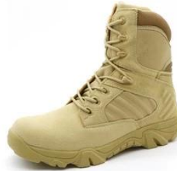
Military Army Boots