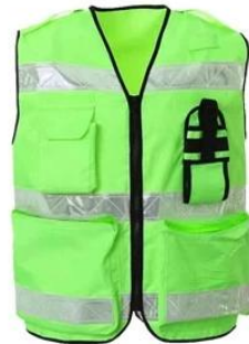
Reflective Safety Vest