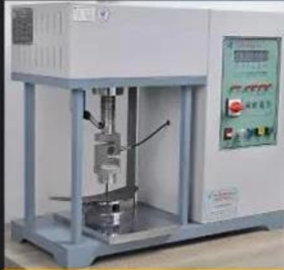
Midsole Test \geq 1200 Newtons