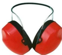
Ear muff/ Plugs