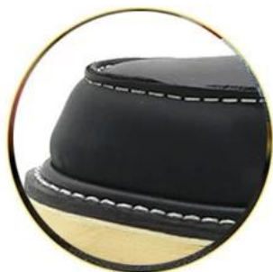
Waterproof cow genuine leather upper

Removable metatomical HI-POLY footbed provides long-lasting underfoot support and comfort.