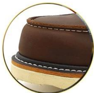
Waterproof leather upper

Removable metatomeal HI-POLY footbed provides long-lasting underfoot support and comfort.