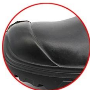
Waterproof cow leather upper

Removable metatological HI-POLY footbed provides long-lasting underfoot support and comfort.