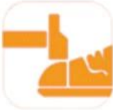
200 JOULE TOECAP