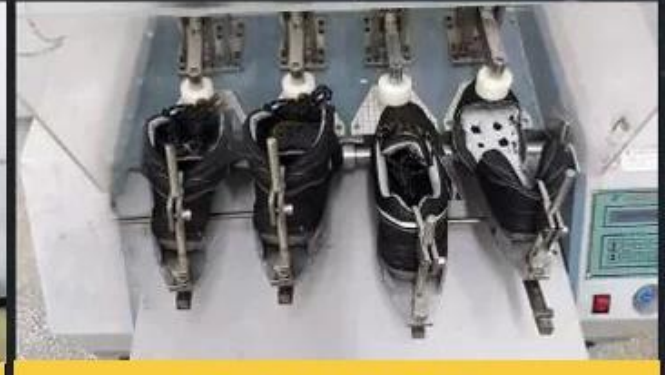
Flex Tester ≥ 36,000T