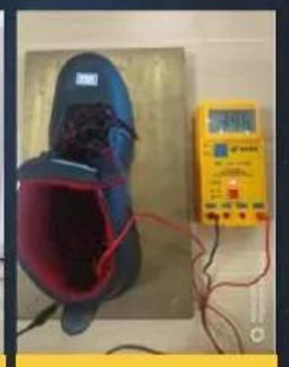
ESD Anti-Static Test