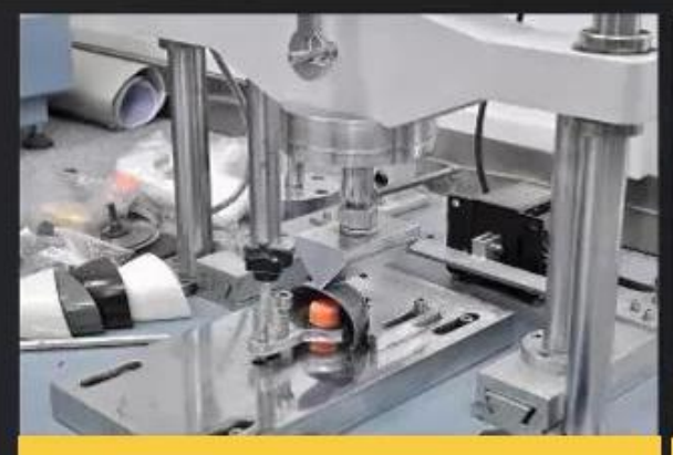
Toecap Test≥200 Joules