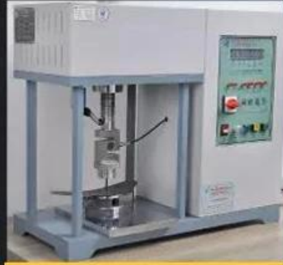
Midsole Test≥1200 Newtons