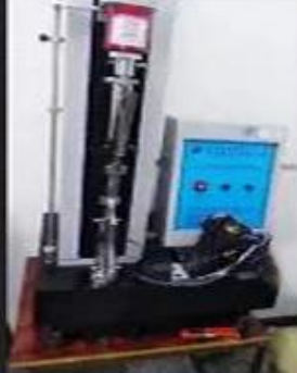
Bondness Test ≥4.0N/mm