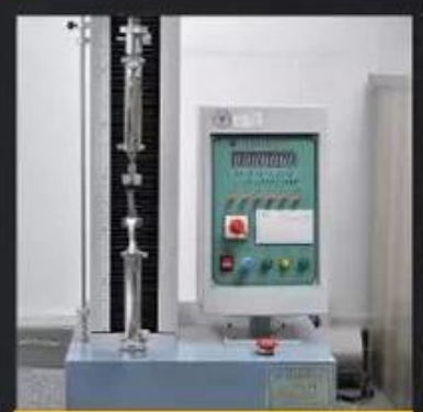
Tear Strength ≥120N