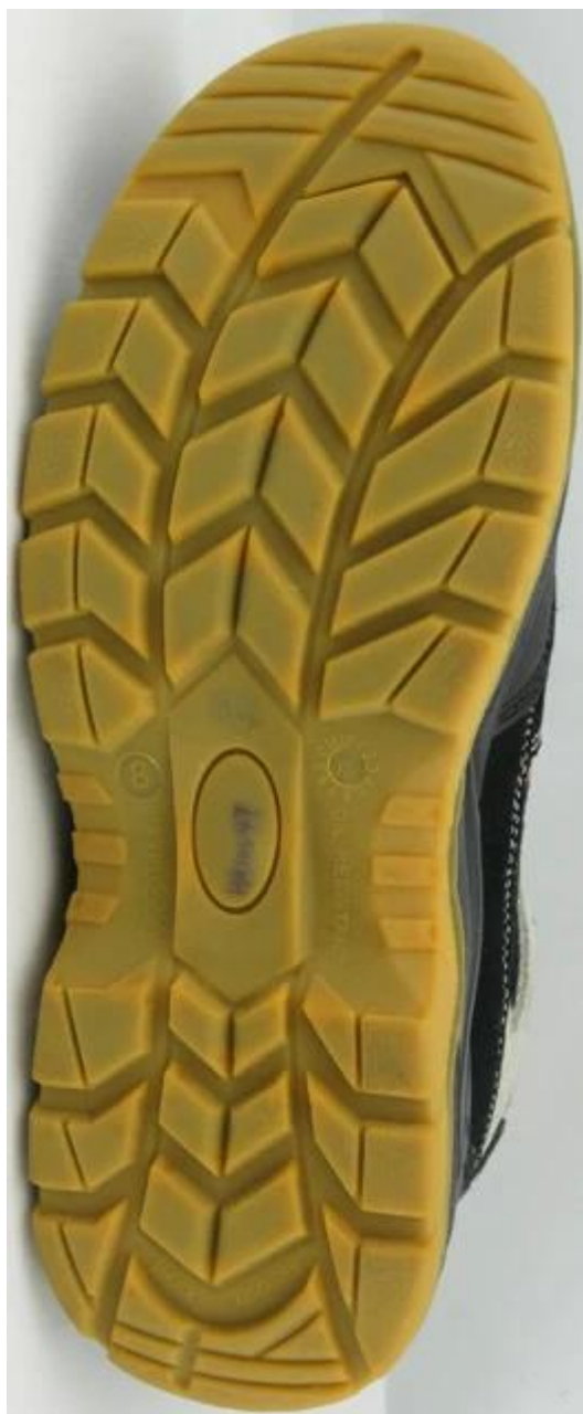
Scarpe di sicurezza unico modello di spettacolo: