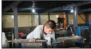
2. Putting Polyester Lining