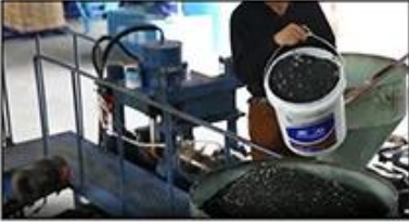
1. Mixing Materials