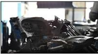
4. Open The Mould