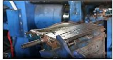
3. PVC Injection