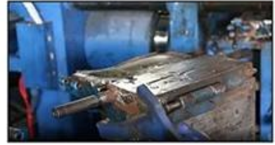
3. PVC Injection