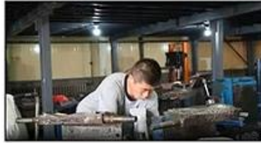
2. Putting Polyester Lining