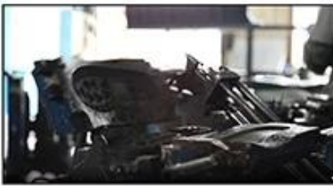
4. Open The Mould