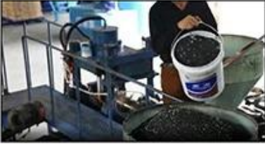
1. Mixing Materials