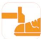
200 JOULE TOECAP