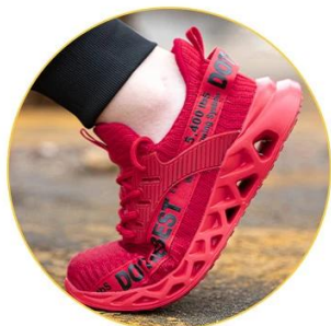
Breathable Mesh Upper

Breathable & Comfortable Uppers Compared with the traditional steel toed leather shoes , the fly weavingshoes are more breath and comfortable , and it will better fit your feet.