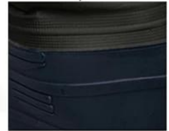
Heat Seal Technique