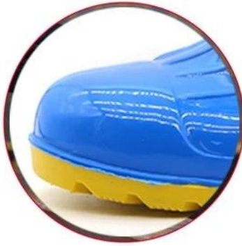
Waterproof PVC upper