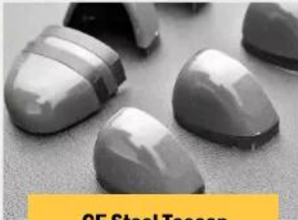
CE Steel Toecap