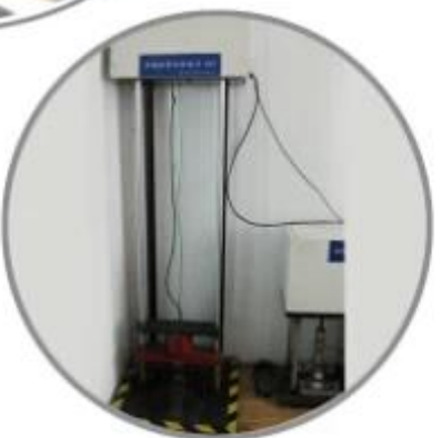
Impact Resistant Testing Machine