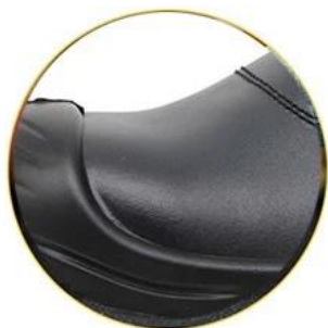
Waterproof leather upper

Removable metatological HI-POLY footbed provides long-lasting underfoot support and comfort.